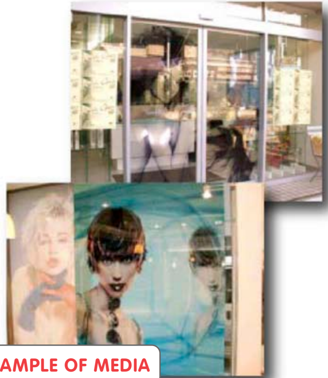
EXAMPLE OF MEDIA

Printed Transfer Paper Transparent Fluoride Layer Image Forming Layer Transparent Base Film Layer Transparent Adhesive Layer Release Liner