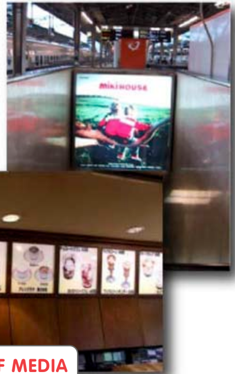
EXAMPLE OF MEDIA

One of the unique properties of this substrate is that it can be printed on either side of the adhesive, which allows adhesion to the interior of a lightbox or a glass panel, which makes it great for shop window decals also.